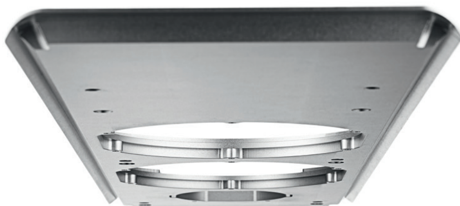
▽ A MASSIVE MACHINED ALUMINIUM FRONT BAFFLE IS THE NON-RESONANT PLATFORM USED TO HOUSE THE DRIVER UNITS.

craftsmanship is evident in the construction, as well as from the literature that comes with the speaker. It's a good read and obviously the result of a passionate company culture.