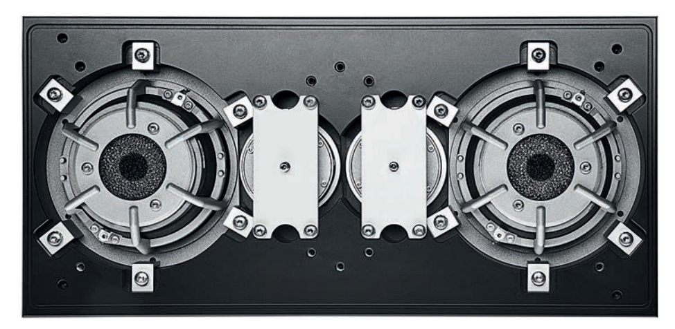
ABOVE: The Evidence Platinum's dual Esotar<sup>2</sup> tweeters and two 150mm midrange drivers are mounted behind a thick aluminium front baffle in the centre portion of the speaker's enclosure