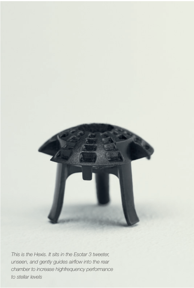
This is the Hexis. It sits in the Esotar 3 tweeter, unseen, and gently guides airflow into the rear chamber to increase highfrequency performance to stellar levels

"The C20s were timbrel wonders, their tonal capabilities being among the best I've heard." "The complexities of all manner of acoustic instrument, from the extended harmonics of strings, to the 'blattness' and transient speed of brass, to the span and power of percussion and then on to the humanity of the voice... wow!" Edgar Kramer, Soundstage!