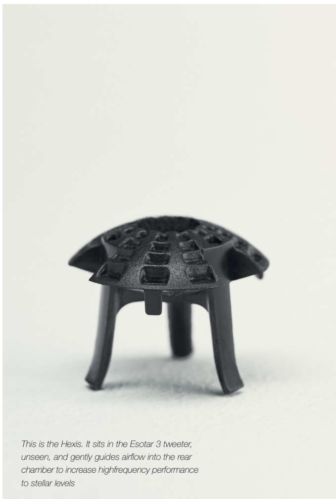
This is the Hexis. It sits in the Esotar 3 tweeter, unseen, and gently guides airflow into the rear chamber to increase highfrequency performance to stellar levels